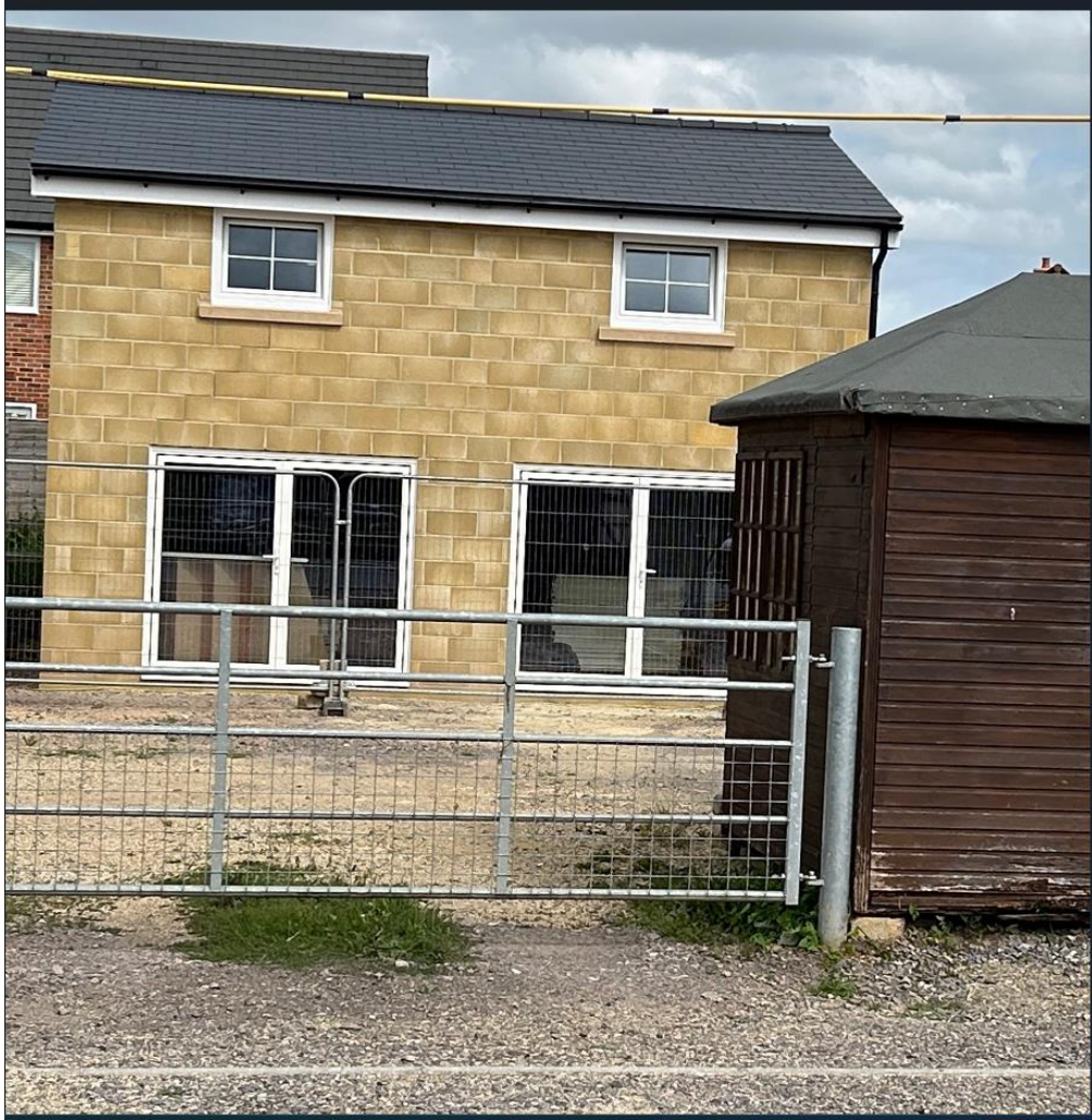
Picture of garage at 489a Semington Road